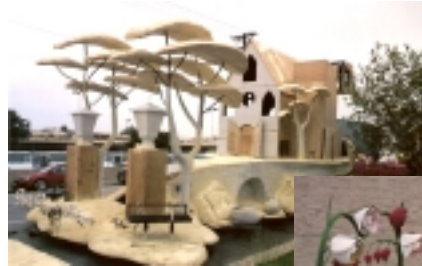
From the early construction stages of cocooning and foaming, to . . .

● Interviews and sound bites are available with designers, builders, sculptors, art and floral directors.