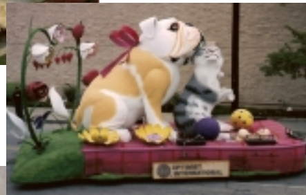
. . . fully constructed, color-coded and decoration-ready . . .