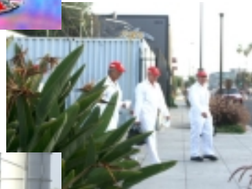
The City of Glendale float (left, top & bottom) will offer parade viewers a “Sneak Preview” as it salutes the city’s historic Alex Theater in the 2009 Rose Parade.