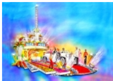
Parade floats begin as a rendering, then construction, and next, testing under the watchful eye of Tournament professionals and volunteers.

Take a peek behind the curtain. From now until showtime – let us entertain you.