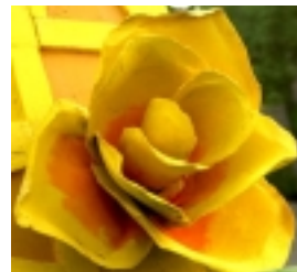
From painted metal to glued-on petal, it’s a year-round process.