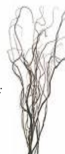
Among entertaining decorations are: Kermit green pom (top); yarrow, liatris, paper bark (second row); nori (above); magdalena ting and curly willow (bottom, left & right).