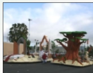
On May 22, 2010 the first road test was held - featuring (from left to right) the Rotary, Odd Fellows & Rebekahs, Kiwanis, Lutheran Hour and Lions entries – the latter two passing like floats in the early morning light.