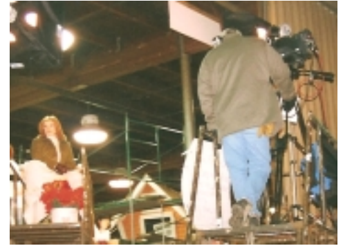
Float sponsors find Phoenix float barns an ideal setting for satellite media tours – beaming their image worldwide.

More than 250 media groups visit or broadcast from Phoenix Decorating Company's two Pasadena facilities each year.