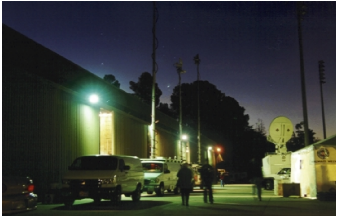
Phoenix Decorating facilities become "media villages" as the press covers our sponsors and their floats prior to the parade. Our personnel are committed to enhancing media exposure.

Media coverage during final preparation runs nearly around the clock with morning, midday, evening and late night broadcasts airing from our facilities – not to mention special satellite media tours which we are happy to coordinate with sponsors. Our web site ( phxdeco.com ) and 24/7 web cameras receive hundreds of thousands of hits!