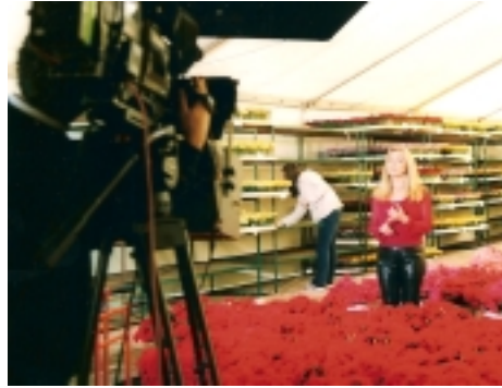
National TV documentary makers annually choose the Phoenix float facilities as the "set" for their shows.